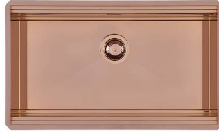
RIVA 750 COPPER SOUS PLAN N034 S58