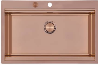
RIVA 750 COPPER N034 F58